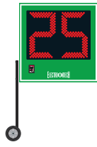
Optional "T-Cart" Leg Kit